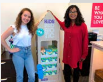
July 2019: visiting WeLo Naturals, a local women-led business.