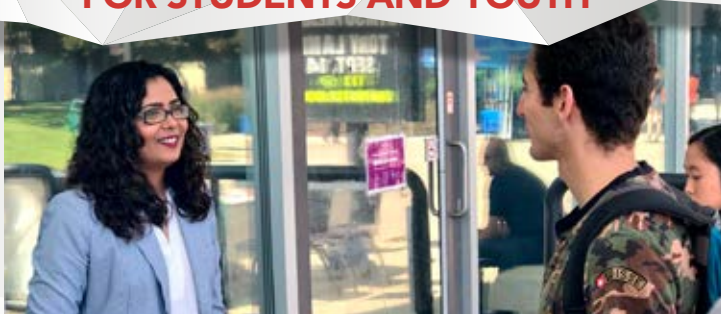
September 2018: hearing from students at UTM