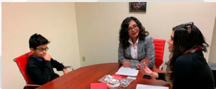
February 2020: Meeting with families in Erin Mills