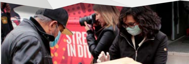
March 2020: volunteering with the Meals on the Move program