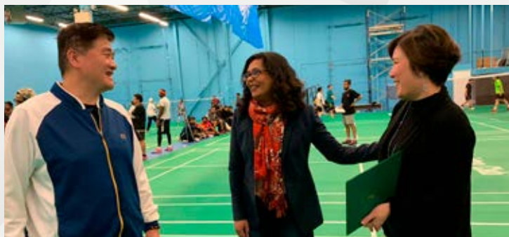
February 2020: Meeting the staff and players at Su Badminton Club

From restaurants to recreation centres, local salons and shops of all types, Canadian businesses have taken on the costs of adapting to public health measures and the impacts of regional lockdowns. Our Federal Liberal government is here to help with a wide range of programs to keep businesses afloat and preserve Canadian jobs across all economic sectors.