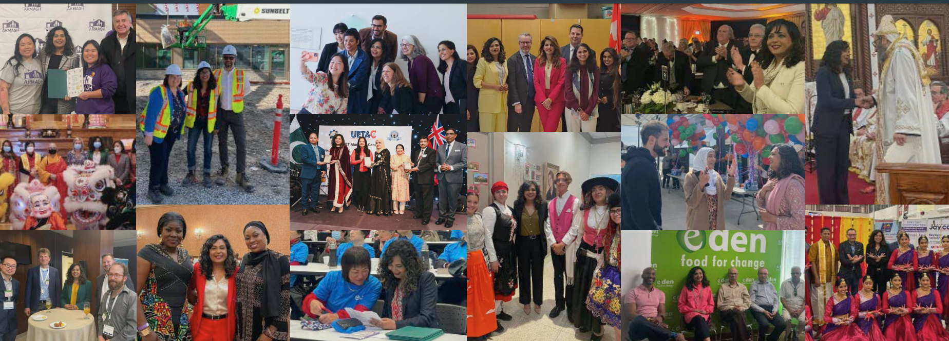
TOP ROW: Armagh House Coldest Night of the Year, Wellbrook place construction site, visiting UTM Medical school, a community meeting with CPA delegates, Standardbred Canada O'Brien Awards, Easter at the Canadian Coptic Centre MIDDLE ROW Chinese New Year at Fu Guang Shen temple, UETAC Alumni dinner, Eid-ul Fitr celebrations in Mississauga BOTTOM ROW: Science Meets Parliament reception, Canadian Samaritans for Africa event, Canada Seniors Forum seminar, Carassauga Portuguese Pavillion, Eden Food Bank donation drive, Thai Pongal with the Mississauga Tamil Association